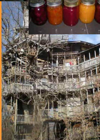
World's Largest Tree house Crossville off Genesis Road past new high school—take a left at bend in the road—a couple miles down gravel road donation box