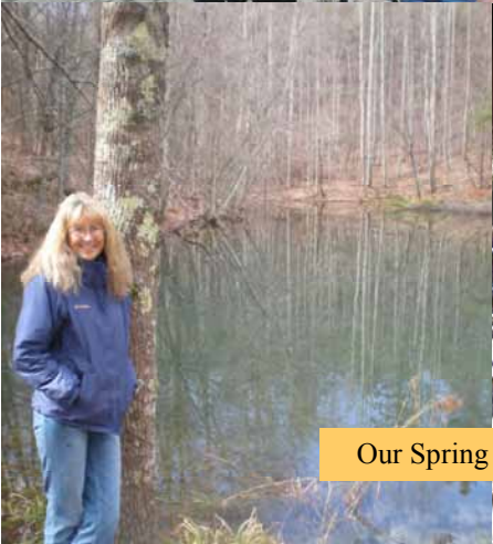
Our Spring Fed Fish Pond

Simple pleasures in life. Take time to smell the roses. Make every day count. Don't sweat the small stuff. Relax, Explore, Unwind. Count the stars and your blessings. Laugh, Live, Love. Respect Mother Nature. Live life to the fullest.