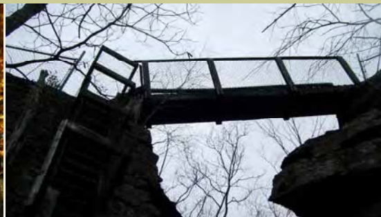
Piney River Park in Spring City Twin Loop Overlook Trail (2 mi) & Piney River Trail (10 mi) plus river playing and splashing...