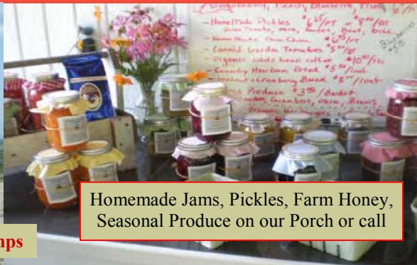
Homemade Jams, Pickles, Farm Honey, Seasonal Produce on our Porch or call

Simple pleasures in life. Take time to smell the roses. Make every day count. Don't sweat the small stuff. Relax, Explore, Unwind. Count the stars and your blessings. Laugh, Live, Love. Respect Mother Nature. Live life to the fullest.