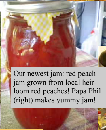
Our newest jam: red peach jam grown from local heirloom red peaches! Papa Phil (right) makes yummy jam!