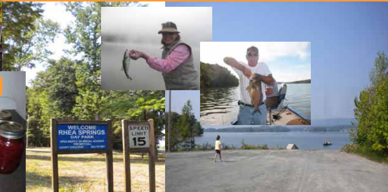
Watts Bar Lake & Tennessee River Swimming, boating and fishing in this 20 mile long lake just 7 miles down the mountain! Spring City's Rhea Springs Lake Park (Re-opened Sept 2011!)