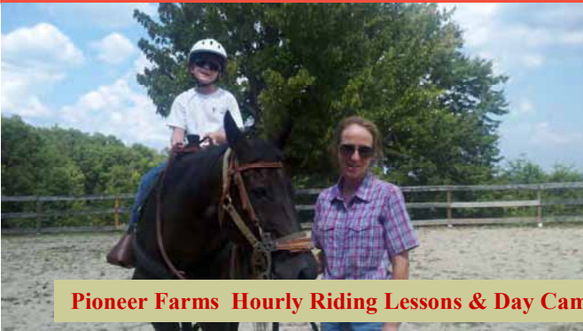
Pioneer Farms Hourly Riding Lessons & Day Camps