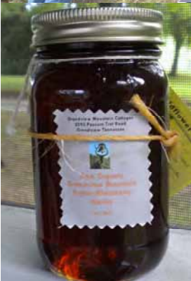
Our raw organic honey has just been harvested - available at our farmhouse.